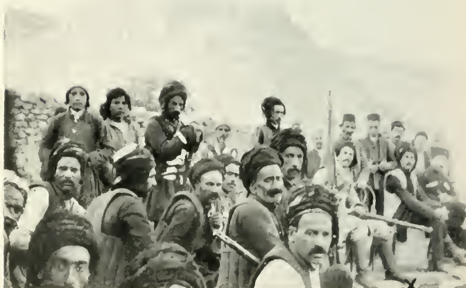
THE CHIEF (X) AND HIS TRIBESMEN